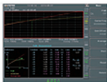
P1dB Point Measurement

EMC pretest mode is ideal for electromagnetic compatibility (EMC) test which is the preliminary stage of electronics product development. Users can identify and resolve problems at the early phase to avoid product revision after it was finalized. Hence, product development cycle and cost will be greatly reduced which is beneficial to saving cost and time for product entering the verification stage.