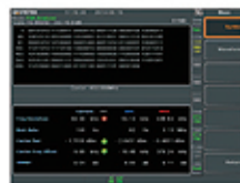
FSK Signal Demodulation & Analysis

All active components have linear dynamic range for power output. Once output power reaches the maximum level, active component will enter the non-linear saturated area of P1dB point and cease amplifying signal intensity as well as produce harmonic distortion. It is very useful for P1dB point measurement in active components such as low noise amplifier, mixer and active filter.