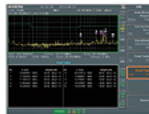
EMC Pretest Mode

GSP-9300 supports the fast sweep mode with sweep speed up to 307usec. Users can use the fast sweep mode to capture transient signals such as Tire-pressure monitoring system (TPMS), Bluetooth frequency hopping signals, tuned oscillator, and other interfering signals in ISM frequency band, etc