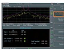
2FSK Signal Analysis

ASK/FSK demodulation and analysis measures parameters including AM depth, frequency deviation, modulation rate, carrier power, carrier frequency offset, SINAD, symbol, and waveform. Users can set AM depth, frequency deviation, carrier power and carrier offset for Pass/Fail testing result.